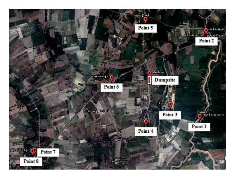
Figure 2 The positions of water sample collection surrounding dumpsite area.

For the present study, water samples were collected 8 points in the dumpsite area surrounding of Nai Muang Sub-district Administrative in November, 2009 and April, 2010. (Figure 2) Most of the fresh water samples were collected from tubewell pump station and just only one point from hand pump drawn water. (Table 1) Water samples were collected in clean and sterile one litter polythene cans rinsed with diluted HCl to set a representative sample and stored in an ice box. Samples were protected from direct sun light during transportation to the laboratory and metals were analyzed as per the standard procedures. All the metals were determined by using atomic absorption spectrophotometer. The instrument was used in the limit of precised accuracy and chemicals used were of analytical grade. Double-distilled water was used for all purposes.