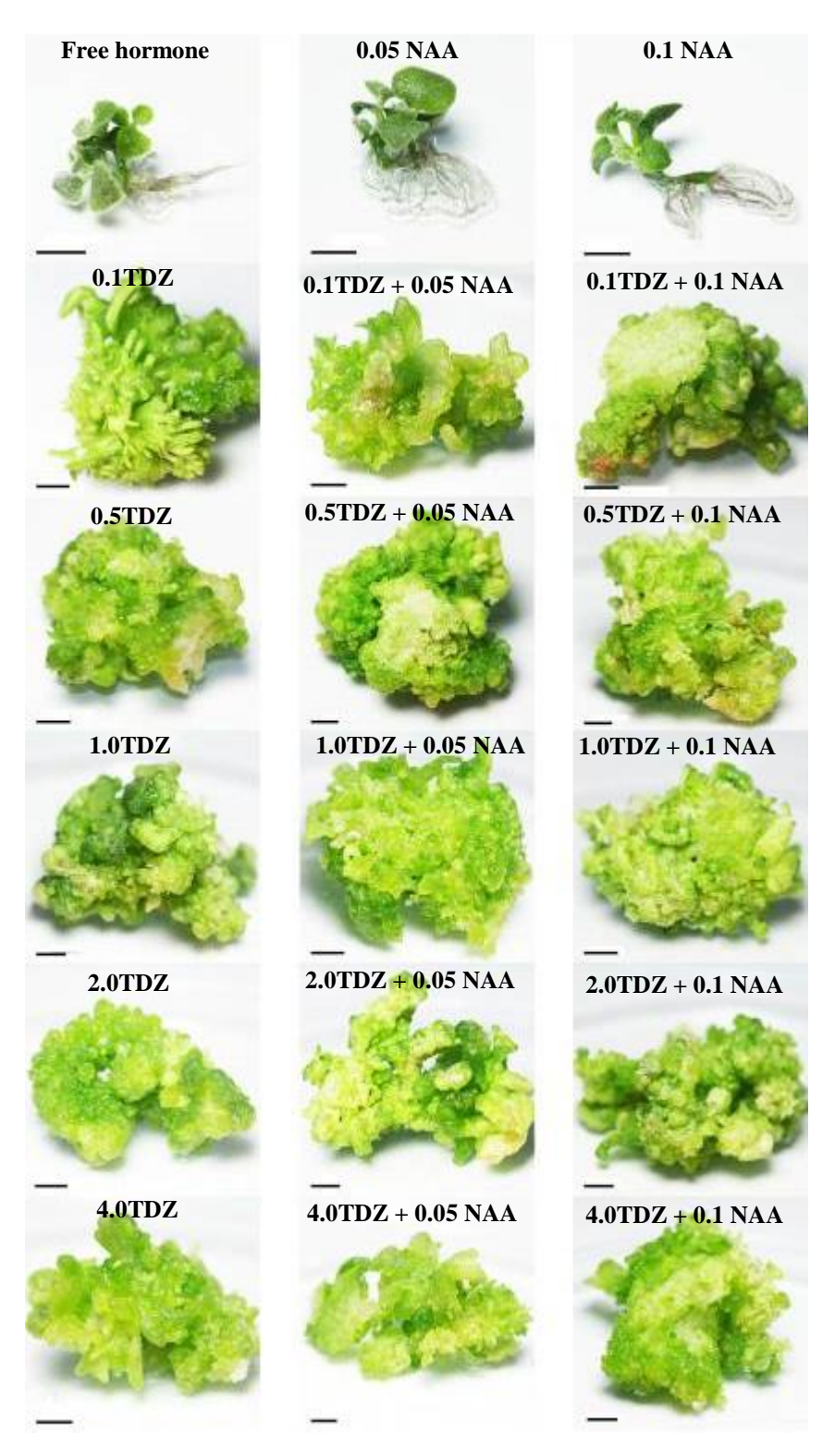
Fig. 3 Effect of TDZ and NAA on growth and development of Kalanchoe rhombopilosa explants after cultured for 8 weeks (bar = 5 mm)