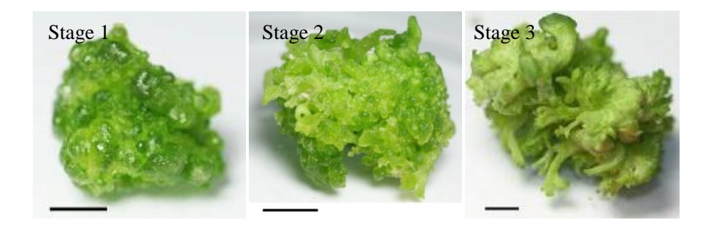
Fig. 2 Developmental stage of callus observed on Kalanchoe rhombopilosa explants after cultured for 8 weeks (bar = 5 mm)

Fig. 1 Kalanchoe rhombopilosa explants, ventrally (A) and dorsally (B) attached leaf blade, vertically (C) and horizontally (D) placed stems, and shoot tips (E), after cultured on MS medium for 9 weeks (bar = 5 mm)