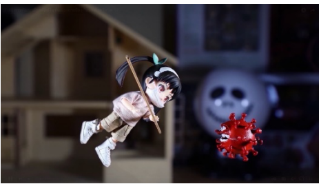
Mee Mee debuted and encountered mons.