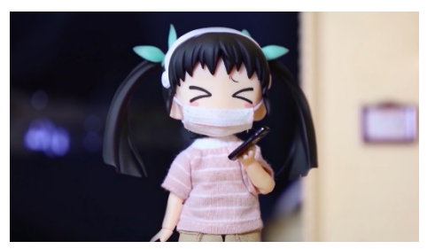
Launch of the covid virus monster