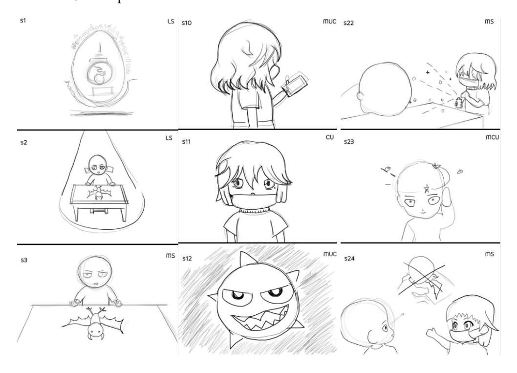
Figure 2. Storyboard stop motion animation short film: the spread of COVID-19 virus prevention.