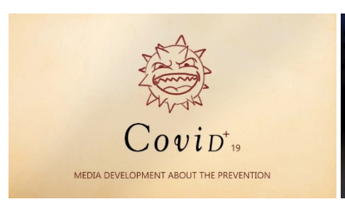
Opening scene and title