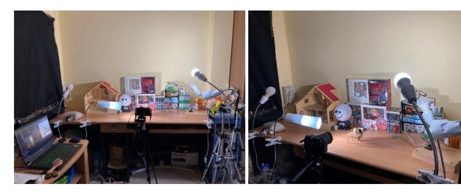
Figure 3. Filming scene, the lighting scene.